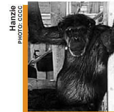
Hanzie

Yoko (#358) performed for a Missouri circus. His trainer would give him a hard-boiled egg and a shot of hard liquor for dinner, along with a piece of newspaper to use as a blanket. Yoko was transferred to LEMSIP in 1981. He spent 16 years in research there, being used in HIV, nasal spray and other studies. He was continuously subjected to invasive procedures, including 147 biopsies. He now resides at Fauna.