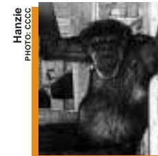
Hanzie

Yoko (#358) performed for a Missouri circus. His trainer would give him a hard-boiled egg and a shot of hard liquor for dinner, along with a piece of newspaper to use as a blanket. Yoko was transferred to LEMSIP in 1981. He spent 16 years in research there, being used in HIV, nasal spray and other studies. He was continuously subjected to invasive procedures, including 147 biopsies. He now resides at Fauna.