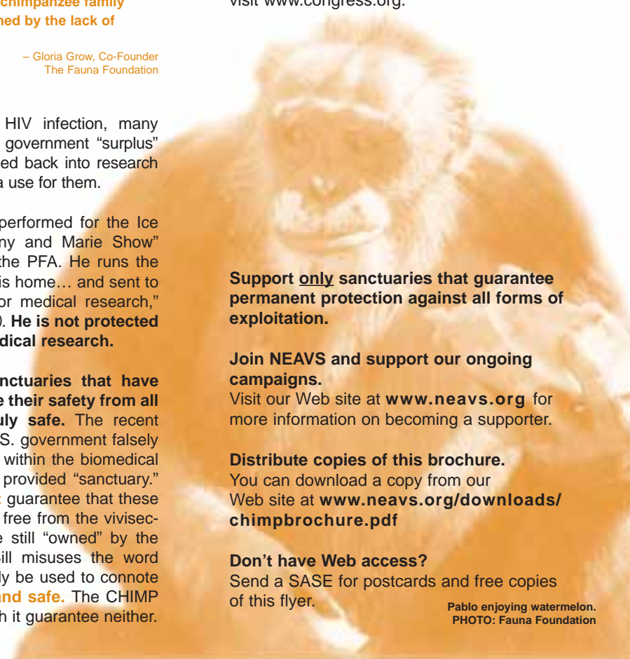
Pablo enjoying watermelon.

Contact your members of Congress demand that all “retired surplus” chimpanzees be guaranteed permanent sanctuary and that any children born to them remain in permanent sanctuary. For contact information call the Congressional switchboard (202) 224-3121 or visit www.congress.org .